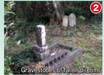
Gravestones of fallen pilgrims

There is a signpost here marking the fork in the road from Ise, "left for the Beach Route to Shingu, right on the Beach Route to Shingu, right on the Hongu Route, but the road is hard going up to Konogi."