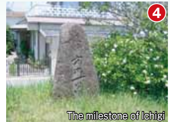
The milestone of Ichigi

This area was very susceptible to the sea water flooding into the town and fields. To protect themselves from these natural disasters, they put up this monument honoring the Deity of Water. Later, floodgates were built for added security.