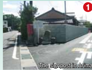
The signpost in Arima

There is a signpost here marking the fork in the road from Ise, "left for the Beach Route to Shingu, right on the Beach Route to Shingu, right on the Hongu Route, but the road is hard going up to Konogi."