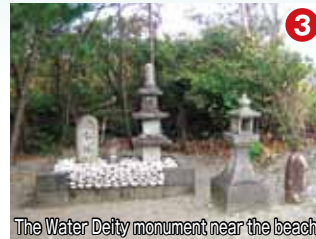
The Water Deity monument near the beach

In the old days there were no bridges across the rivers flowing into the Sea of Kumano, so pilgrims had to dash across the shallows at the river mouth between waves. Here at Shiwara Gawajiri there stands a memorial monument to those who didn't make it across and were swallowed by the sea.