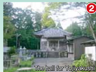
The hall for Yojiyakushi

Built in the heart of the mountains, terraced rice paddies march up the slope, one after the other to form this splendid view covering 7.2 hectares. There is a viewpoint with parking looking down on this window to old Japan.