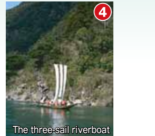
The three-sail riverboat

For the people here, this waterfall is a place to find peace and solace. There used to be a tea house here for raftsmen who floated timber from up stream to the market down in Shingu. There were a lot of people passing by in the old days.