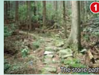
The stone path

Though rather narrow, about 800 meters of the stone path remain intact. With things like the remnants of a charcoal kiln, you can get an idea of what life was like long ago.