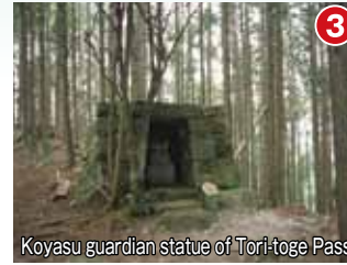
Koyasu guardian statue of Tori-toge Pass

The view point which is perched on the steep mountain side looks down on 7.2 hectares of beautiful terraced rice paddies. Records from 1601 show that there were 2,240 paddies in all at that time.