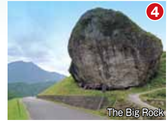
The Big Rock

Like most passes, there is usually a brisk wind here. This guardian statue was put here in 1851. The name "Koyasu" means "child safety."