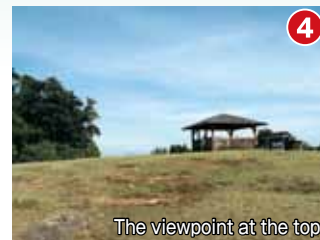
The viewpoint at the top

Many pilgrims came here to worship here before starting the Saigoku Kannon Pilgrimage of 33 Buddhist temples worshipping deities of mercy. Nearby stands the grave of an ascetic mountain priest who came to here to drive out the bandits on this stretch of the road.