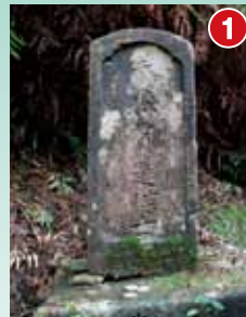
Gravestones of fallen pilgrims

From these gravestones you can see how widely popular this pilgrimage route was. The first grave belongs to a man from Ibaraki (500km NE), the second from Nagasaki on the southern island of Kyushu (800km W) and the third from Hiroshima (500km W). Sadly, some of the pilgrims couldn't survive the journey, but local people generously gave them a proper burial.