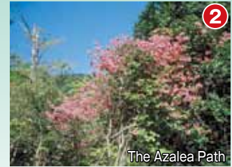
The Azalea Path

Travelers always used this rock as a bench, so it got the name, "Iko Ishi" or "The Rest Rock". The cool wind coming over this ridge makes it an excellent place to take a break.