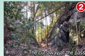
The cut-away at the pass

Long ago, wagons used to use this part of the route. It is easy to see their tracks even now.