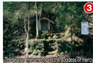
The prayer monument and the goddess of mercy

It is said that they carved out 1000 slabs of graphite to clear the way for this path. This must have been an enormous amount of work considering the limited tools they had for excavation at the time.