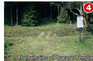
The remains of Ougase Temple

A prayer stone with the words, "Namu Amida Butsu" (a mantra repeated in order to never forget Buddha's grace). A statue of a guardian of mercy is enshrined inside the small shine.