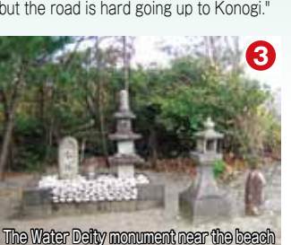
This area was very susceptible to the sea water flooding into the town and fields. To protect themselves from these natural disasters, they put up this monument honoring the Deity of Water. Later, floodgates were built for added security.